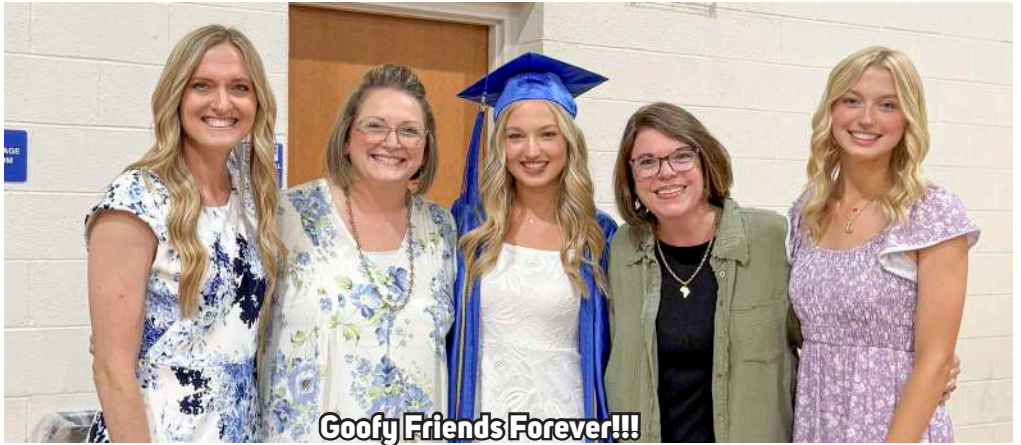
Goofy Friends Forever!!!