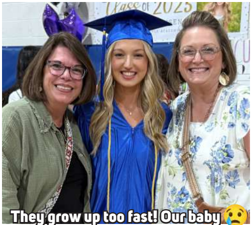
They grow up too fast! Our baby 🥹