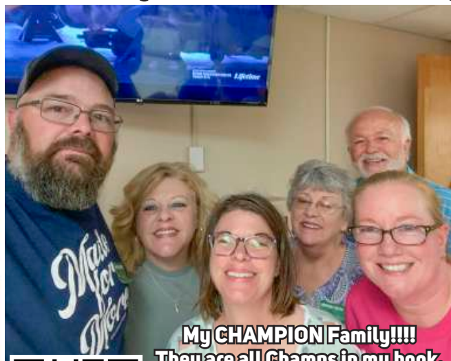
My CHAMPION Family!!!! They are all Champs in my book.