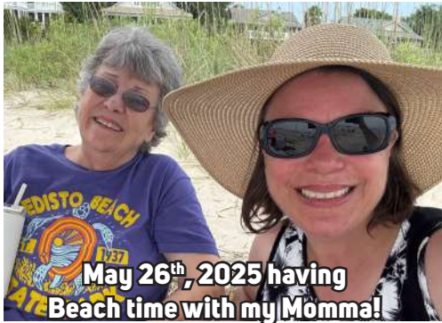
May 26 th , 2025 having Beach time with my Momma!