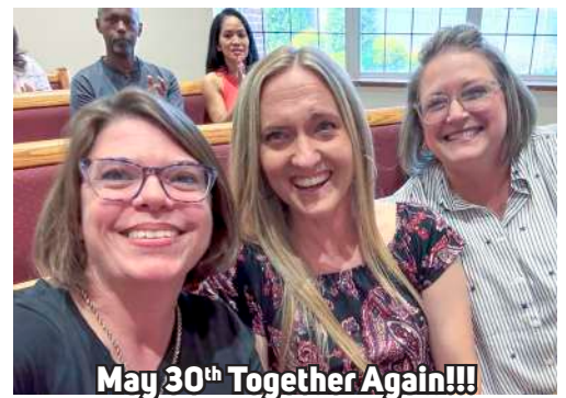
May 30 th Together Again!!!