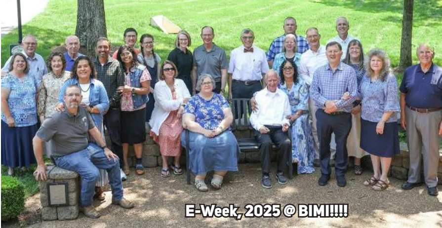
E-Week, 2025 @ BIM!!!!!