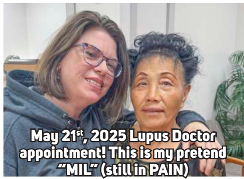
May 21 st , 2025 Lupus Doctor appointment! This is my pretend “MIL” (still in PAIN)