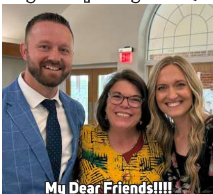
My Dear Friends!!!!