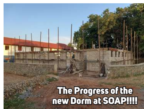
The Progress of the new Dorm at SOAP!!!!