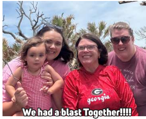
We had a blast Together!!!!