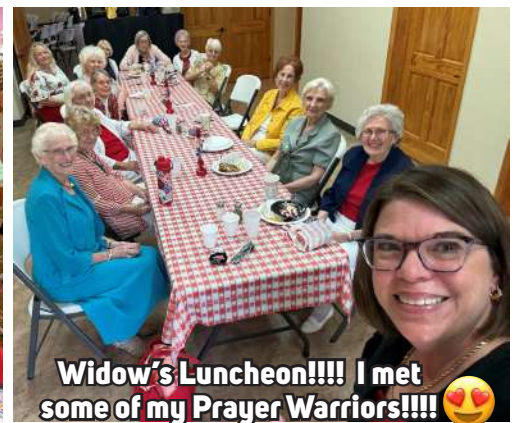
Widow's Luncheon!!!! I met some of my Prayer Warriors!!!! 🥰