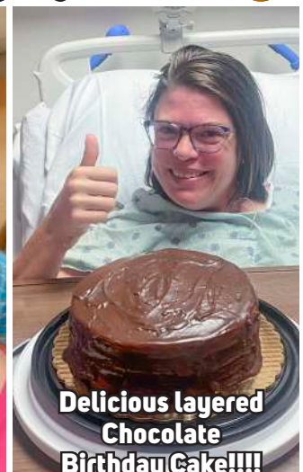
Delicious layered Chocolate Birthday Cake!!!!