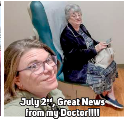
July 2nd, Great News from my Doctor!!!!