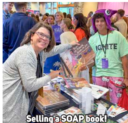
Selling a SOAP book!