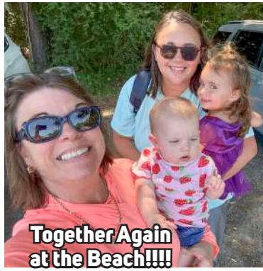
Together Again at the Beach!!!!