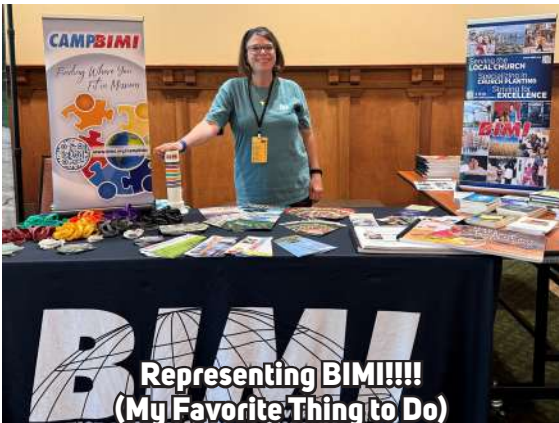
Representing BIM!!!! (My Favorite Thing to Do)