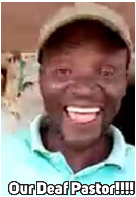
Our Deaf Pastor!!!!