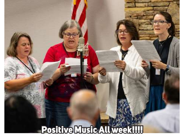
Positive Music All week!!!!