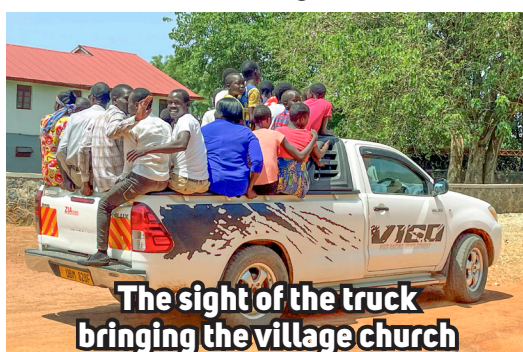
The sight of the truck bringing the village church