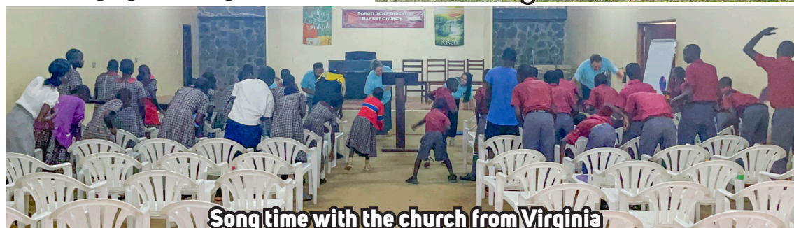
Song time with the church from Virginia