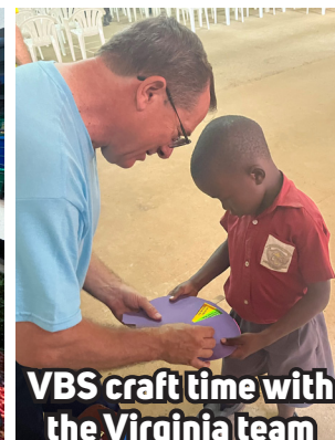
VBS craft time with the Virginia team