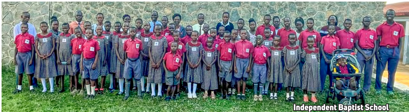
Independent Baptist School