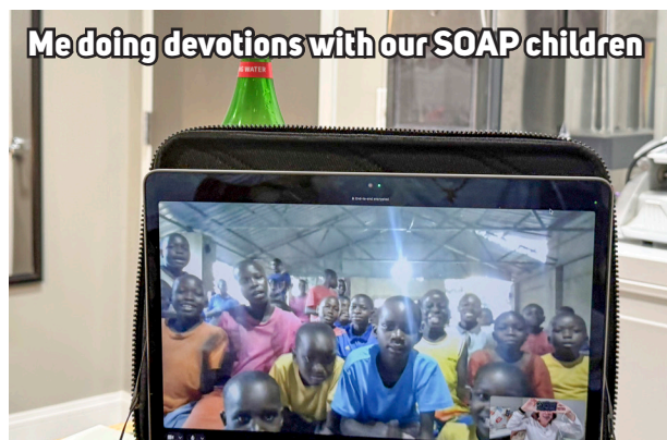
Me doing devotions with our SOAP children