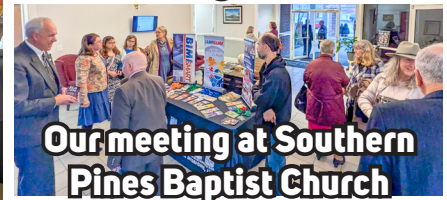
Our meeting at Southern Pines Baptist Church