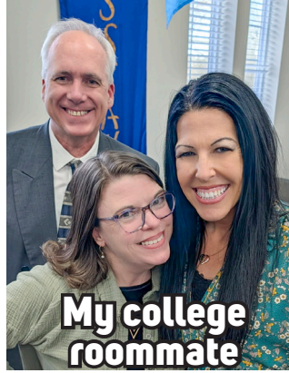
My college roommate

"I thank my God upon every remembrance of you." — Philippians 1:3