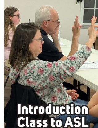
Introduction Class to ASL