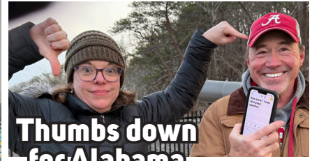
Thumbs down for Alabama