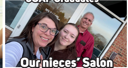
Our nieces' Salon

Home Address: 201 Old Evans Rd. • Martinez, GA 30907 • 706-755-9671 • www.Kerri2Uganda.com • kerri2uganda@gmail.com