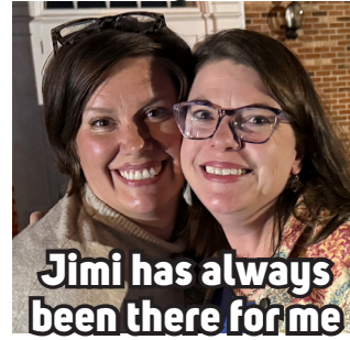
Jimi has always been there for me